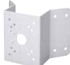
Corner Mount VSBKTA151