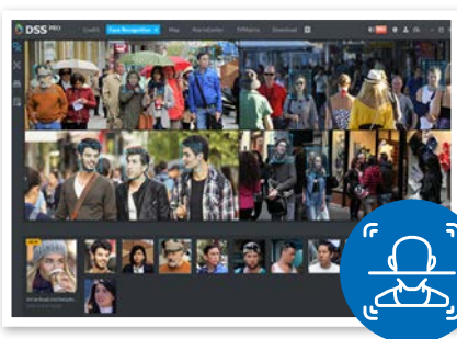
AI Powered Facial Recognition