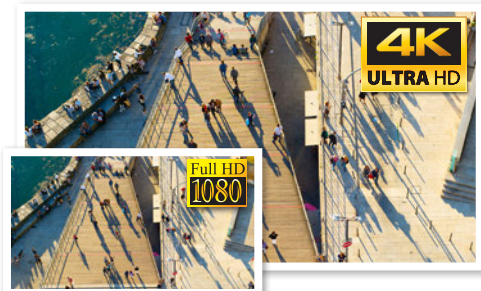
Up to 4K Ultra HD Resolution