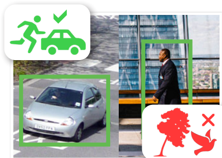
Smart Person & Vehicle Detection