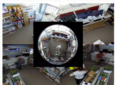
Fisheye Image Dewarp Modes