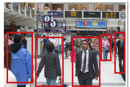
Intelligent Video Functions