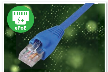
Extended PoE up to 800m