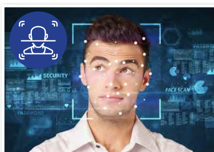
AI-Enhanced Face Detection