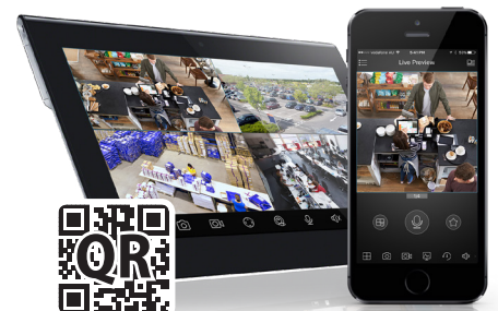
Remote view from your device