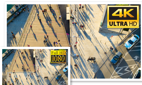
Stream Ultra HD over coax