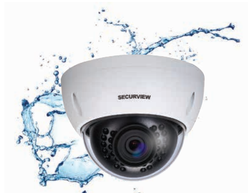
Weather & Vandal Resistant