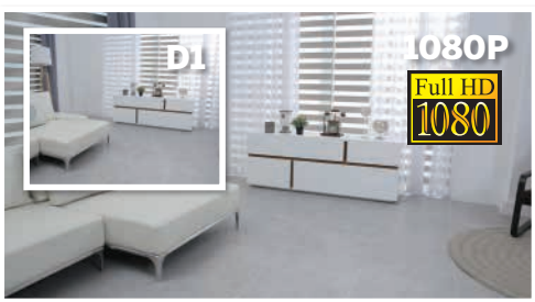
Up to 5x Image Resolution vs D1