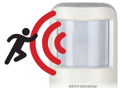
Pet Immune PIR Motion Sensor