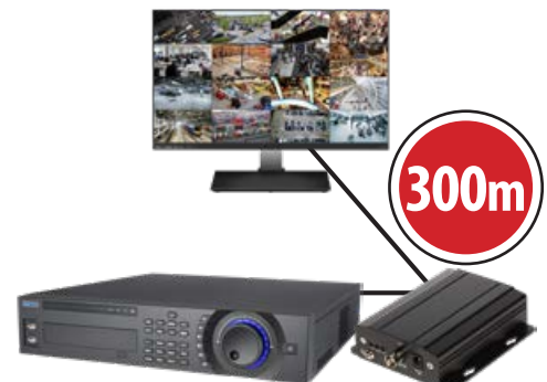
Extend DVR Display Beyond 300m