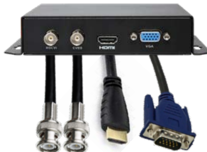
Output Video to HDMI, VGA & Coax