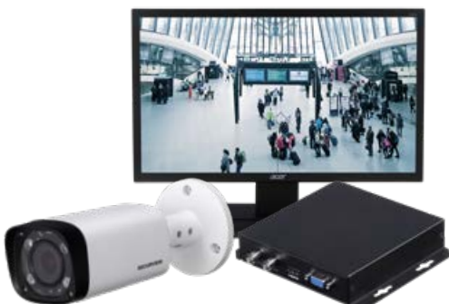
Create Spot Monitors for HDCVI Cams