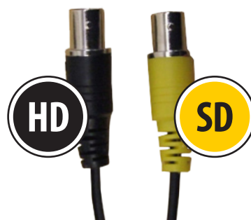
Dedicated HD / SD Outputs