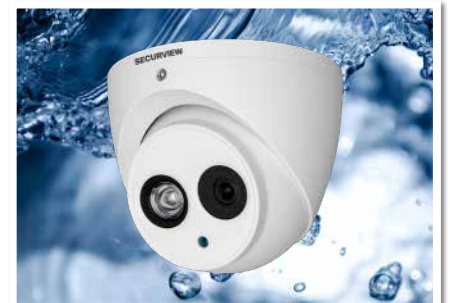
Weather Resistant Housing