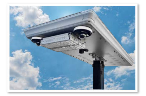
Carry loads up to 40kg