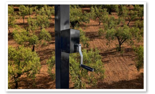
Quick manual installation