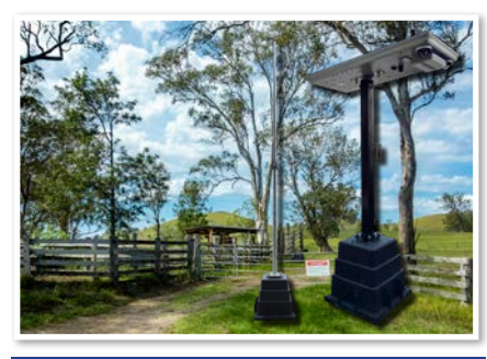
Suitable for remote locations