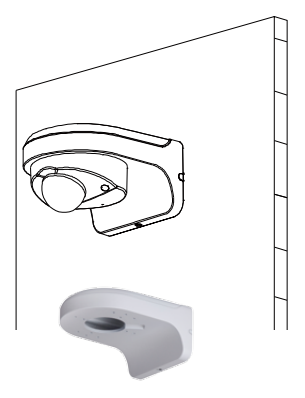
Wall Mount VSBKTB204W